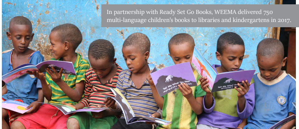
In partnership with Ready Set Go Books, WEEMA delivered 750 multi-language children's books to libraries and kindergartens in 2017.